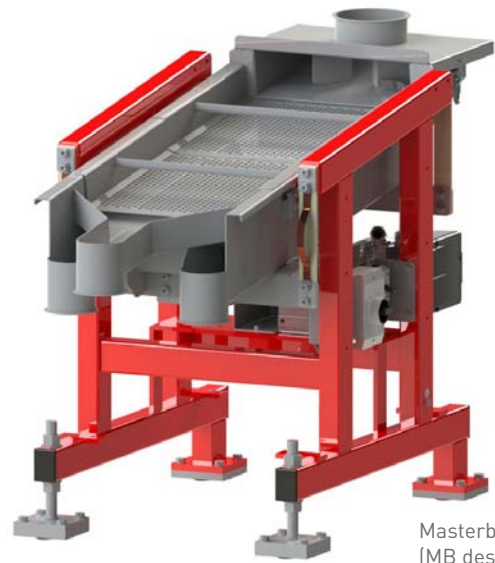
Masterbatch-Design (MB design)